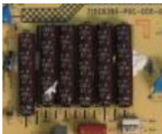
On Power PWB

Electrolyte Capacitors which diameter/height is larger than 25mm is installed on Power PWB. These capacitors can be removed by using nipper to cut the leads.