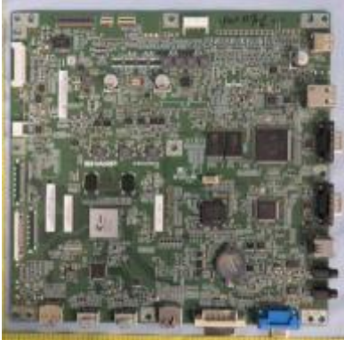
Main I/F PWB (1pcs)

All PWBs can be removed by screw driver.