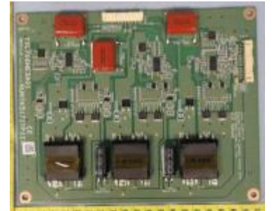
LED driver PWB (1pcs)