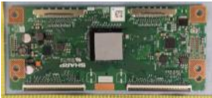
T-CON PWB (1pcs)