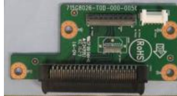
OPS PWB (1pcs)