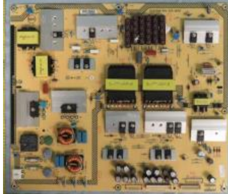
Power PWB (1pcs)